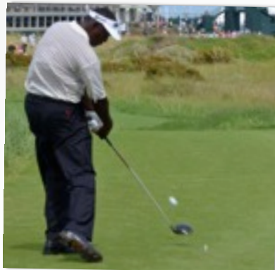
EXTENSION TO STRIVE FOR